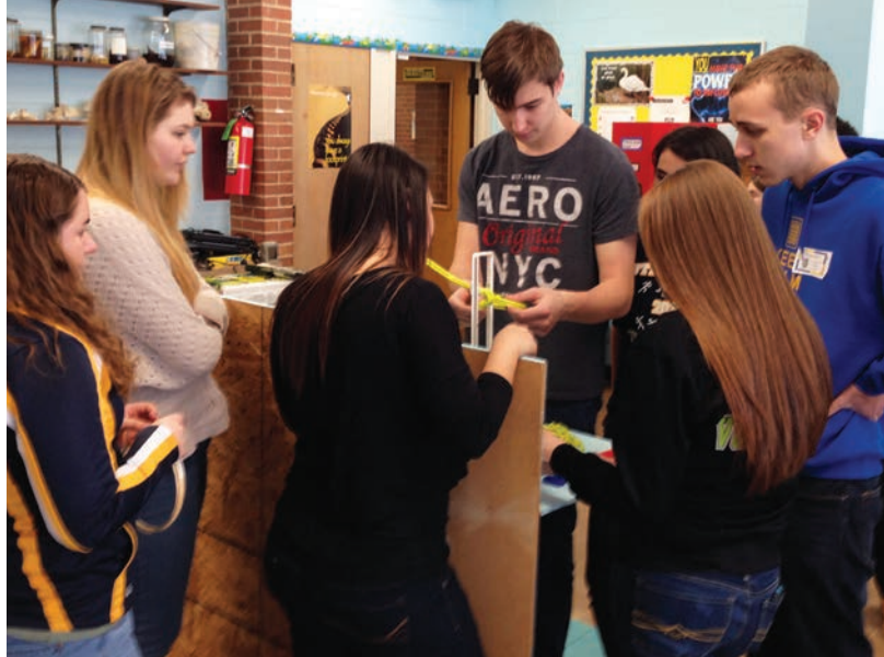
Students from Luther North College Prep preparing for the Rube Goldberg Machine Contest held on February 20

As urban ministry catalysts, each of the partners is committed to using their unique skills and experiences in providing support, resources, leadership, mentoring, communication, coordination, and training while living in the Spirit and following the Spirit’s leading in all they do. The command to “Go and make disciples,” is as relevant and as necessary today as when it was first issued by our Lord.