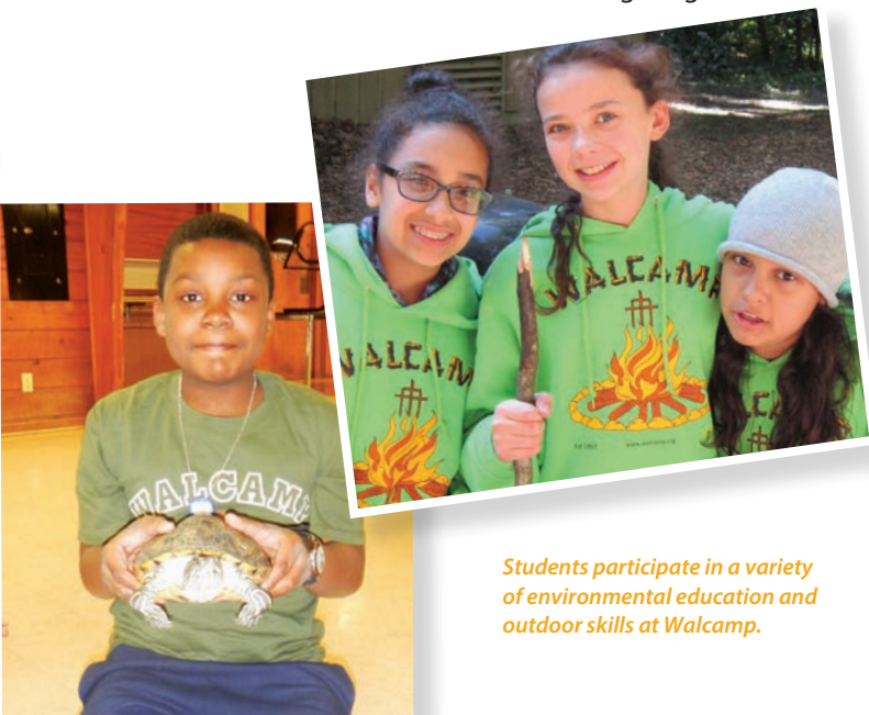
Students participate in a variety of environmental education and outdoor skills at Walcamp.

Does your school or congregation have a vacation bible school or scout troop looking for a service project? Many CLEF schools are located in highly impoverished neighborhoods, where often something as small as a box of crayons may not be within a family's budget. We are seeking partners to conduct school supply drives on behalf of some of Chicago's neediest students. If you are interested in exploring these opportunities further, please contact the CLEF office at 630-595-9310.