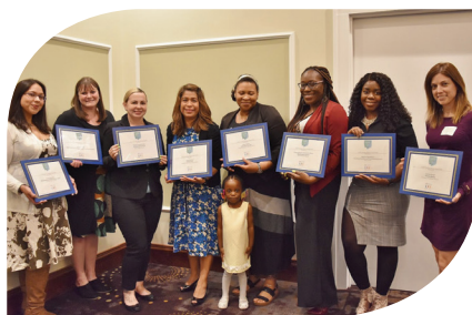
Over $630,000 in teacher salary support!