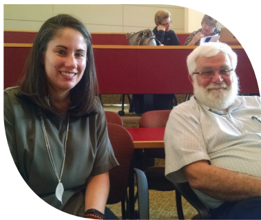
Workshop for school board leaders, principals and pastors sponsored by CLEF.