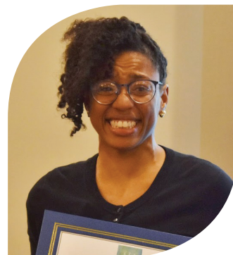
42 teacher dreams funded to enhance classroom instruction and experiences for students!